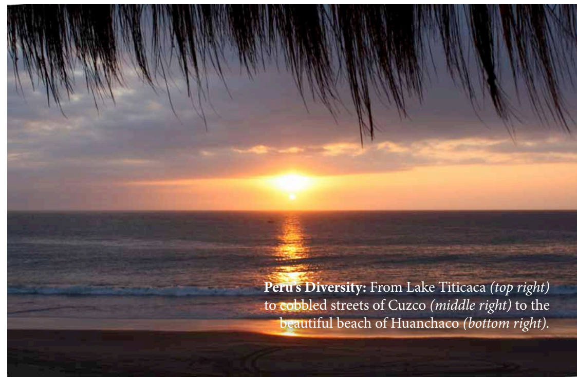
Peru's Diversity: From Lake Titicaca (top right) to cobble streets of Cuzco (middle right) to the beautiful beach of Huanchaco (bottom right).